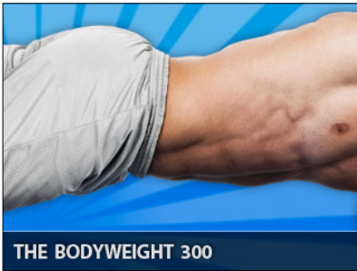
THE BODYWEIGHT 300

These are the bodyweight version of the popular hardcore total-body 300-rep workouts that turned ordinary actors into chiseled Spartan warriors for the movie 300.